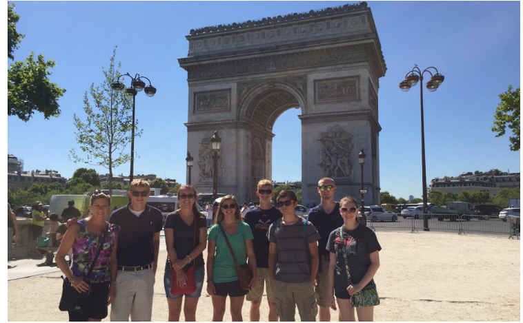
The Arc de Triomphe was one of the landmark stops for the Mexico students. The arch honors those who fought and died in the French wars, particularly the French Revolutionary War and the Napoleonic Wars.

Seven Mexico High School French Club students and three chaperones enjoyed an 11-day tour in France this summer. Day one of the tour was a travel day and day two allowed the group to settle into Paris and meet their tour guide. By day three, the group was ready to take a guided walk through the city, visit the Notre Dame Cathedral, and experience the famed Louvre Museum. Dinner that evening was in the Latin Quarter. On day four the group saw more of the Paris landmarks, including the Eiffel Tower, and took a sightseeing cruise on the Seine River. The fifth and sixth days found the travelers in the Loire Valley where they toured castles and experienced an authentic French Brasserie dinner. It was on to Montpellier on day